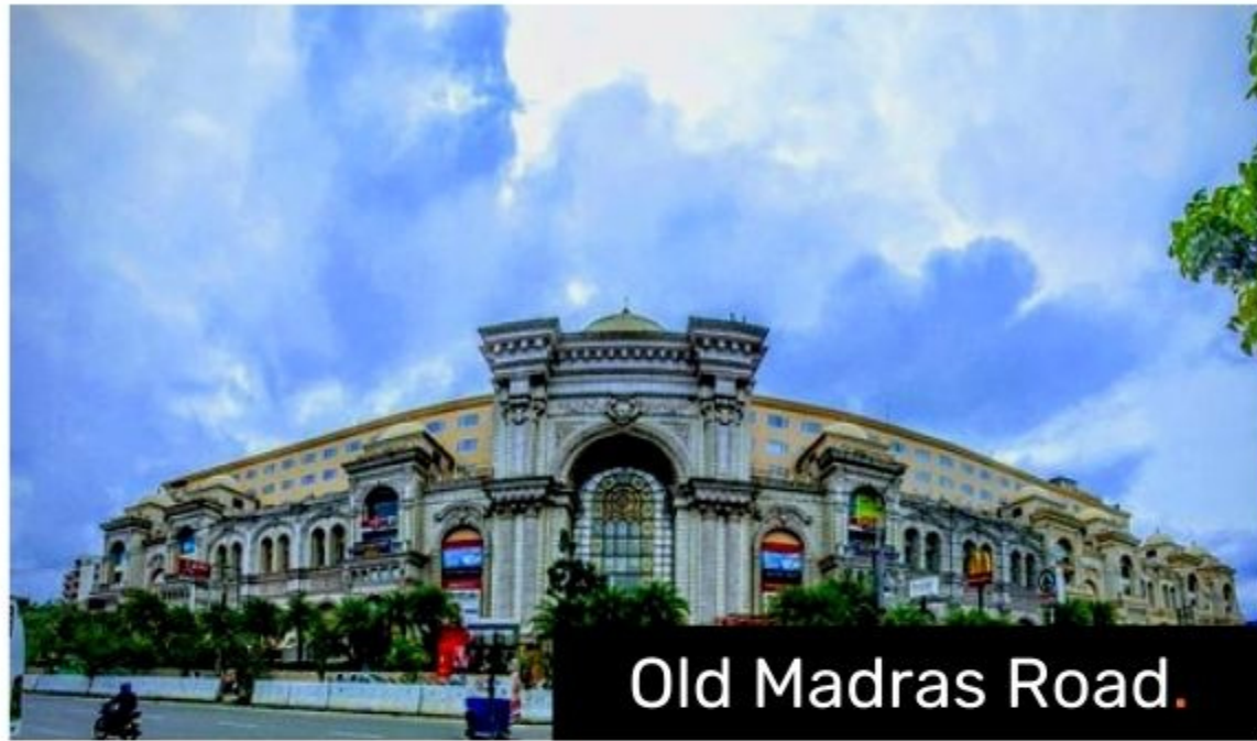
Old Madras Road.